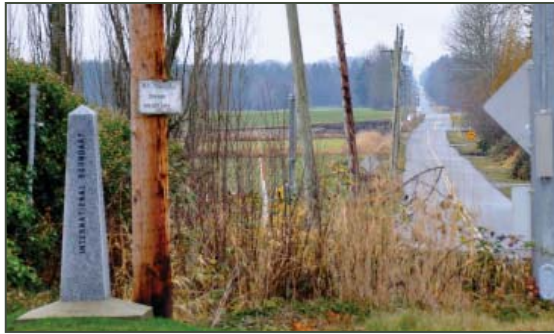
O Avenue, with the U.S. on one side of the road and Canada on the other