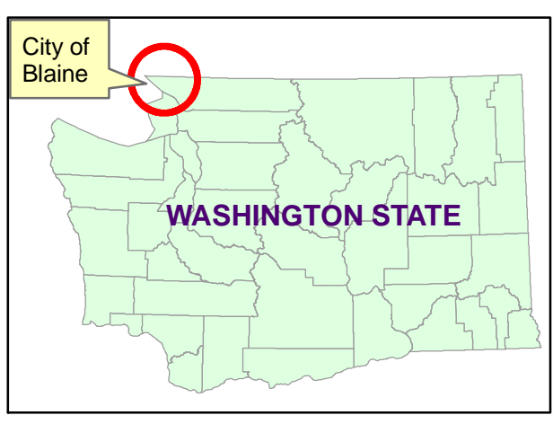
Figure ES-1 Vicinity Map City of Blaine Access Project