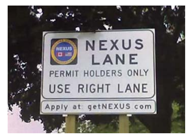
Figure 2-1:New NEXUS sign installed Spring, 2004 on southbound B.C. Highway 99.

Prior to the installation of new signs, an unofficial sign advertising the getNEXUS.com URL was placed over one of the former southbound signs for the PACE program.