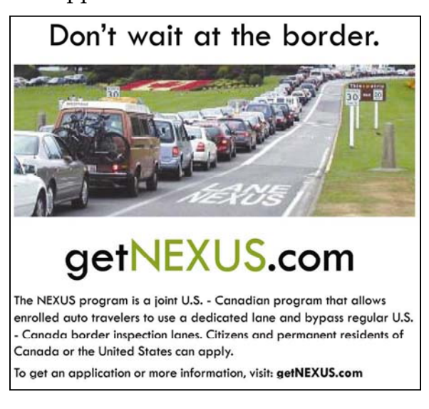
Figure 2-2 : Advertisement run in the 4^{th} Corner View magazine, Spring/Summer 2003.

Newspaper inserts were distributed in the Bellingham Herald on Thursday, June 26. The inserts included the full text of the NEXUS information and application brochure along with two applications.