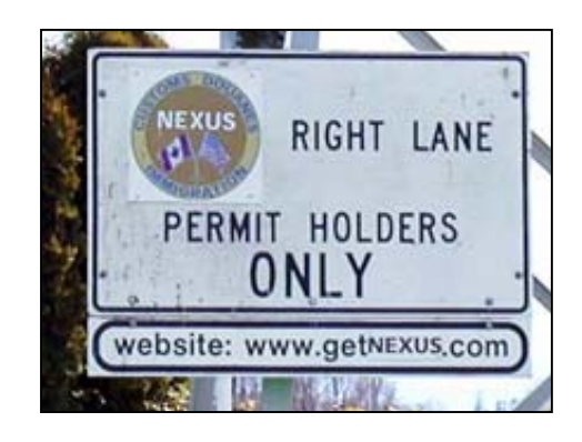
Figure 3-2 : Original southbound NEXUS sign

The two regional magazine ads proved to be the least costeffective form of advertising. This is most likely due to the limited audience of both periodicals.