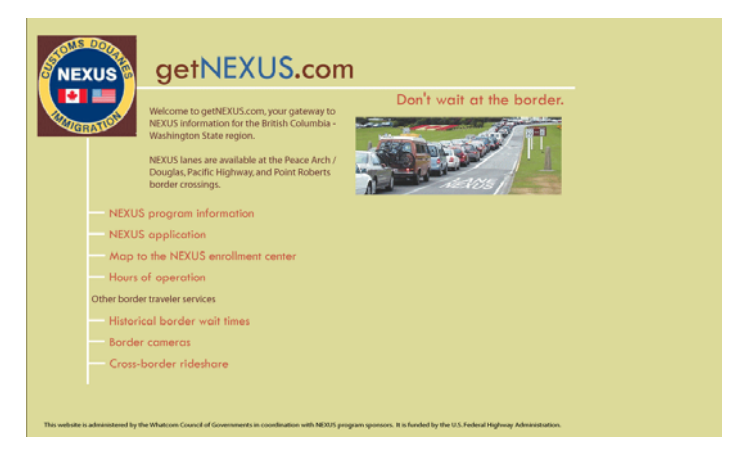
Figure 4-1: Screenshot of getNEXUS.com

One untapped resource for this campaign is the existing PACE and CANPASS databases. These databases are the property of CBP and CCRA, and have all the former members of these pre-approved travel programs. By looking at how many former PACE and CANPASS participants are enrolled in the NEXUS program, the agencies may be able to develop a much more targeted audience for future promotional efforts. Although the addresses of former PACE and CANPASS